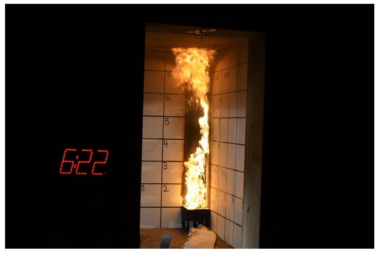
NFPA 286 Fire Test Flame, at 160 kW

When foam plastic insulation materials are used in US buildings, they not only must meet the fire test requirements indicated above; they must also be separated from the interior of the building (or the habitable areas) by a thermal barrier or the foam plastic must meet requirements based on a full-scale room corner test, typically NFPA 286<sup>5</sup>. The figure below shows flames in the NFPA 286 fire test. That test assesses whether the material causes sufficiently low heat release, smoke release and flame spread and whether it is likely that flashover will occur. Typically, the requirements will not be met by common foam plastic materials, which is why the thermal barriers ensure fire safety.