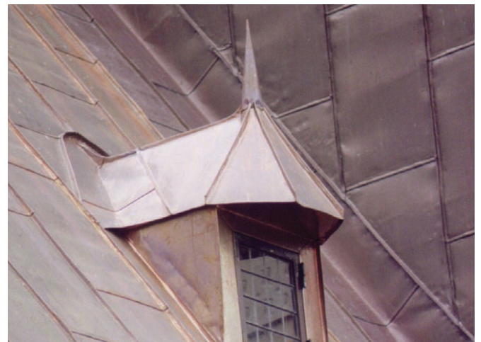
▲ Greater detail and weather integrity can be accomplished with soft-crafted metals as shown on the Kronborg Castle in Denmark.