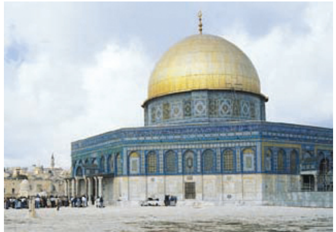
▲ The Dome of the Rock, finished in 691 following the Arabian conquest of Jerusalem, is believed to have originally donned a gold roof. It is now gold-leafed aluminum.

The reference number for architectural titanium is ASTM B265 and the most commonly used size is 28 gauge in 4-foot widths. It is also available in coils and custom lengths.