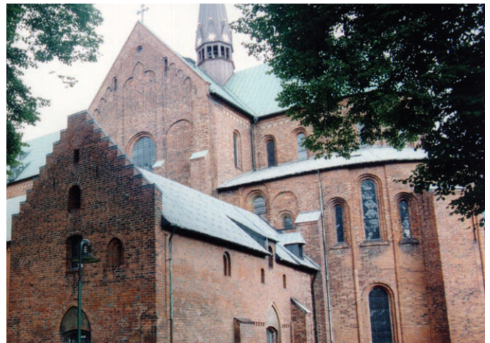
▲ The Roskilde Cathedral in central Denmark date back to 1170 and features a lead roof.

Another little trick that can be used in architectural installations over a wood deck is to install a strip of backer rod between the deck and panel to cause the “flat” of the panel to arch slightly between seams. See the MCA Tech Bulletin