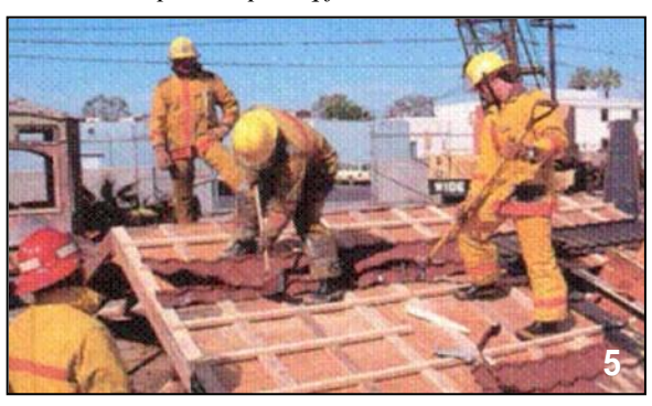
While being lightweight, the shape stamped into the metal makes the panels strong. They can easily be cut with an axe or carbidetipped chain or circular saw. Though an axe is more than adequate, carbide-tipped chain saws cut through the metal very fast and can remove the sheathing at the same time.