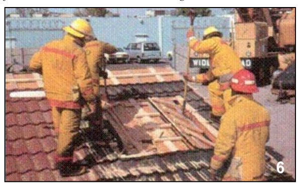
A "Louver" cut (shown here) opens a roof for ventilation without having to remove the roofing.

© 12/20 Ventilating Attic Fires: Metal Panel Roofs | Version 2