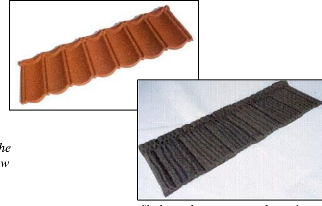
Shake-style stone-coated panel (approx. 15" x 52")

Tile-style stone-coated panel (approx. 15" x 52")