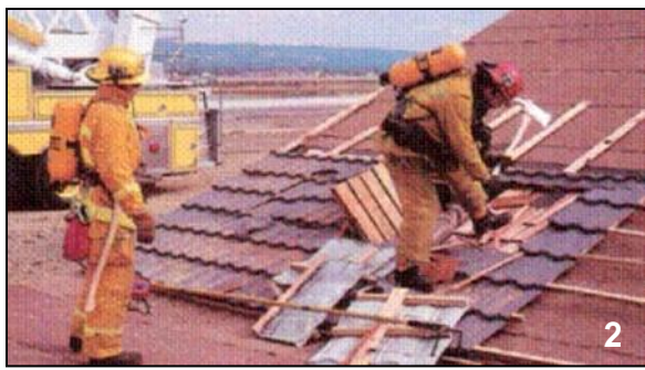
A "head" cut across and high on the roof makes it possible to peel back the metal roof panels (beginning at the top and working towards the bottom) with a rubbish hook.