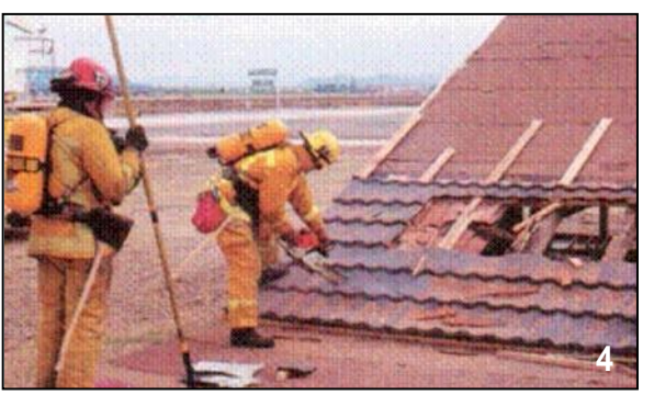
The metal roof may have been installed over old, existing roof materials, such as wood shakes or shingles, asphalt shingles, etc. The weight of the metal roof system would be less than 1.5 pounds per sq ft.