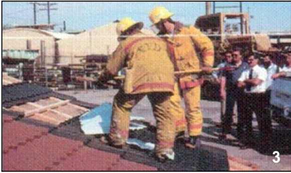
A pick-headed axe can easily lift the front of the panels away from the fasteners. Rubbish hooks are used to peel the panels away from the roof.